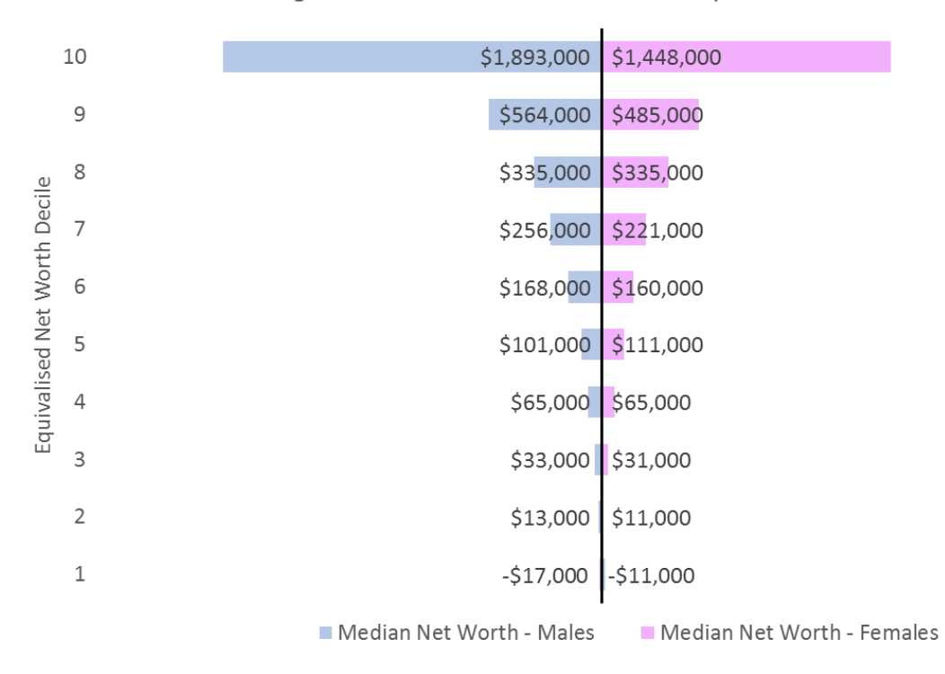
Figure 2: Average net worth for males and females by net worth decile

Average net worth for males and females by decile